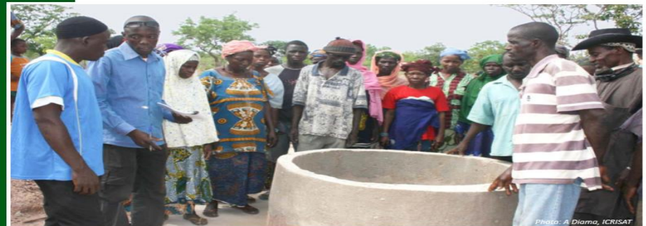
Participants at the newly-inaugurated technology park in Fiola village, Bougouni district. The well was dug to irrigate the research crops that will soon be planted.